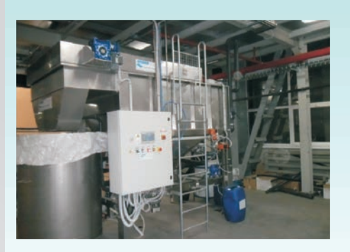
Paint Sludge Dewatering

These world class products have wide applications in: