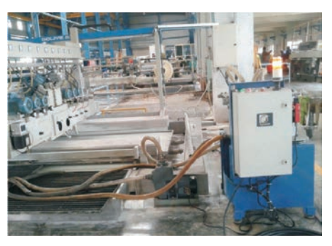
Glass Fines Removal