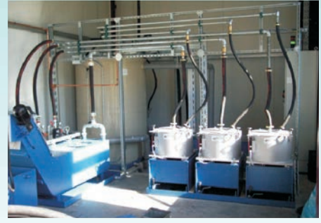
Coolant & Oil Cleaning